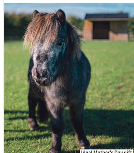
Ideal Mother's Day gift

FOR MORE THAN 50 YEARS, Bransby Horses have been rescuing horses, ponies, donkeys and mules from dreadful situations no animal should ever have to face. By sponsoring one of their beautiful animals for £3 month, you will enable their rescue and welfare teams to continue with their work throughout the pandemic, providing support, advice and education to horse owners without judgement.